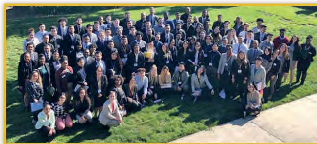
DVC has been a highly-committed partner with the Year Up program since 2017.

D iablo Valley College's (DVC) Year Up program has one major goal in mind: close the opportunity divide, which is the gap between young adults and their exposure to key experiential learning opportunities that successfully prepare them for the workplace. As part of the program, young adults aged 18-24 gain the skills, experiences, and support that will empower and prepare them to reach their potential through careers and higher education.